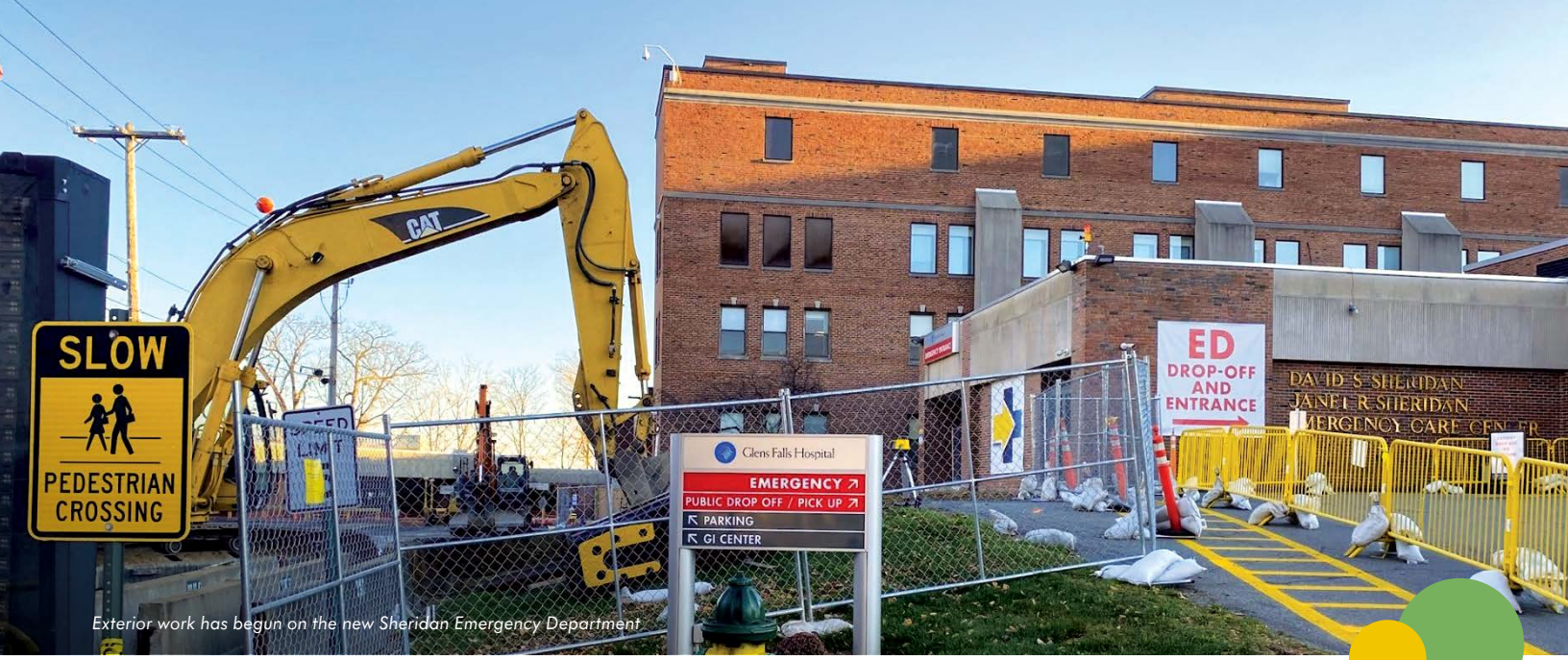
Exterior work has begun on the new Sheridan Emergency Department