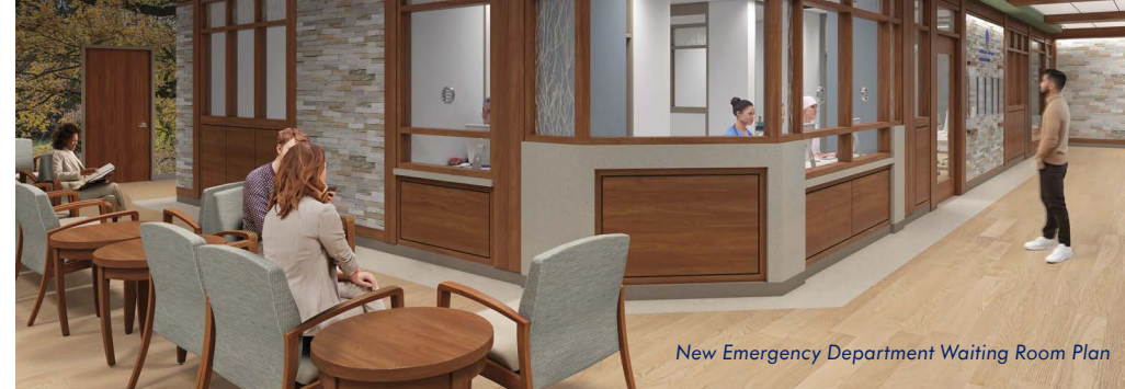
New Emergency Department Waiting Room Plan