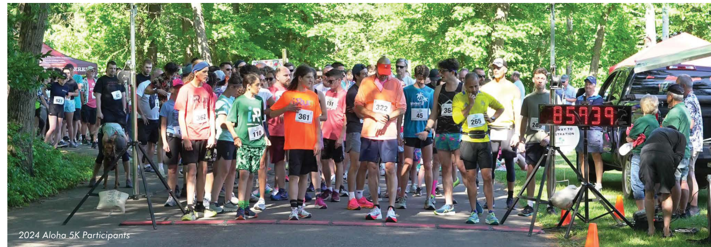
2024 Aloha 5K Participants

Hospital. With the money raised, we've created an endowed scholarship opportunity that will continue to give back year after year to our community healthcare heroes! Thank you to Romeo Toyota for generously donating the beautiful car and to everyone who entered, with your help we raised $58,125!